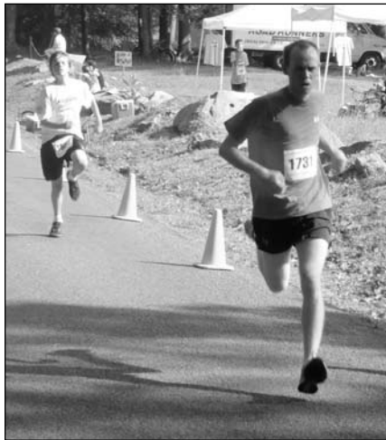
The morning starts with the 5K Wicked River Run.

Record breaking heat and humidity arrive in time for Southampton Riverfest held June 7th with temperatures reaching 100 degrees.