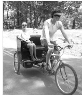
River City Rickshaw provided rides on the closed section of Riverside.