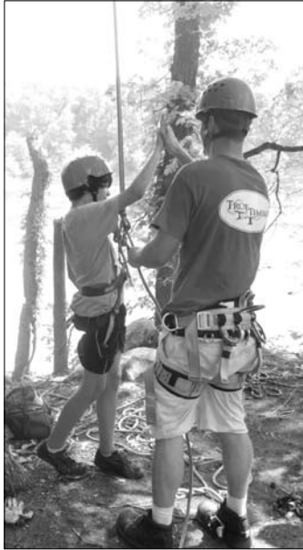
Tree climbing provided by Riverside Outfitters .