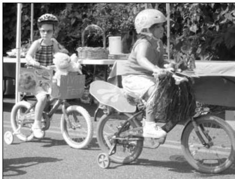
June 7th was a good day for bikes. Young riders show their stuff in the annual bicycle parade.

Feeling a little like Rip Van Winkle, I find Curves beside Ukrop's in the Shoppes at Stratford Hills. And almost next door, Dilligaf tattoo and tanning salon calls the newly renovated, former dry cleaners building home. Food Lion continues to redesign the interior of their store. Santa has gone back inside Once Upon a Vine South. Christmas in July is well over. This slow summer drive has allowed me to catch up with the neighborhood.